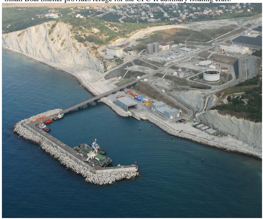
Fig. 1. CPC-R Marine Terminal Small Boat Shelter

Small Boat Shelter provides refuge for the CPC-R auxiliary floating craft.